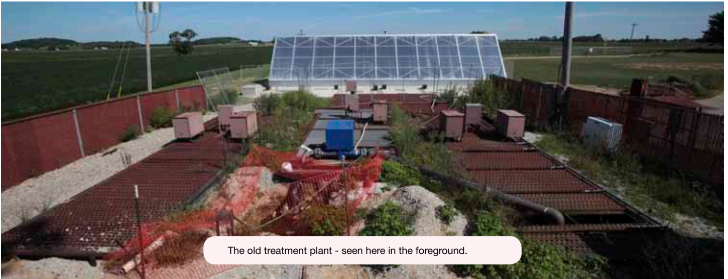
The old treatment plant - seen here in the foreground.